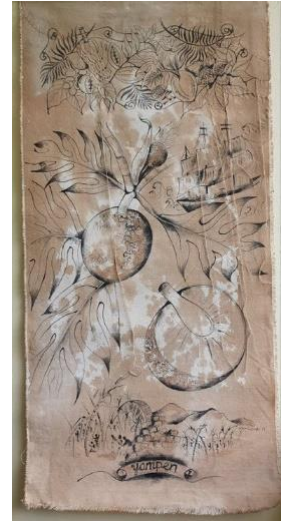
Yampen Story Breadfruit – Artocarpus Altilis Textile Hanging - Natural pigments on canvas 105 x 51 cms