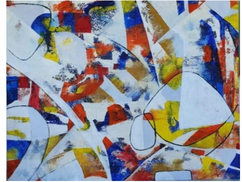
Red, Yellow, Blue & Orange. An Intuitive Exploration (2023) Acrylic mixed mediums, Ink & Wax pastels 20 x 30 x 2 (d) inches

www.carlaarmourart.com IG: @carla.armour.art