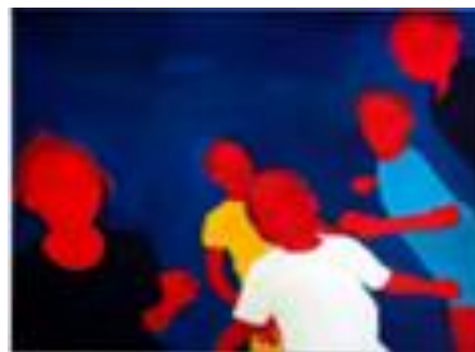
Friends 4 (2003) Oil/mixed media on canvas - 100 x 120 cms

www.paulinemarcelle.com IG @paulinemarcelle